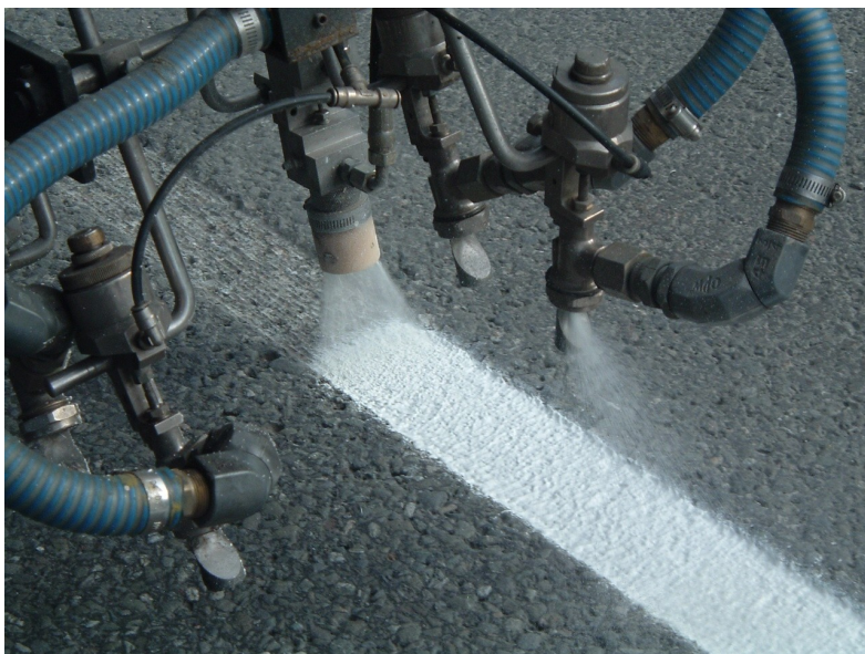
Deciding to Restripe

Reference: Pavement Marking Handbook, (2004) Texas Department of Transportation from http://onlinemanuals.txdot.gov/txdotmanuals/pmh/pmh.pdf