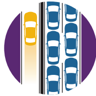
4 Major Express Lanes Projects