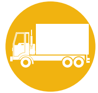
1 Commercial Vehicle Lanes Project